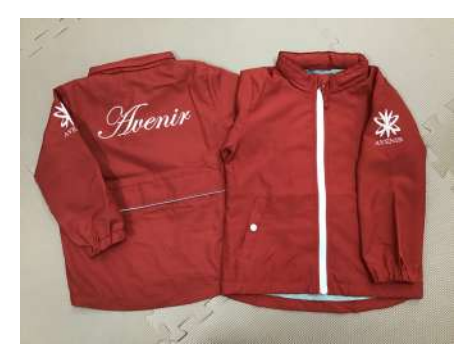
Windbreaker for walks