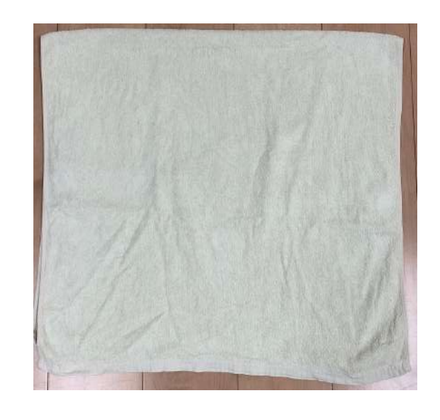
During Spring and Summer we use towelettes.