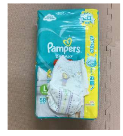
We use Pampers, which has the largest shares in domestic hospitals. It is safe, secure and high quality using the same weak acid used by wet tissues for wiping bare skin.