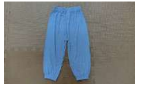
Summer trousers for stroll