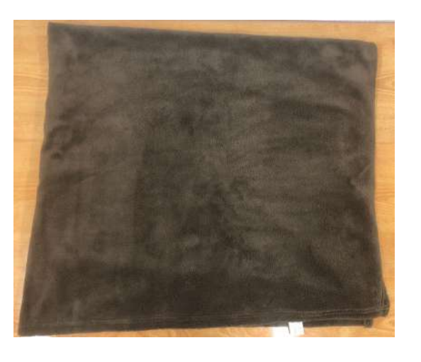
In the Winter we use fluffy microfiber blankets