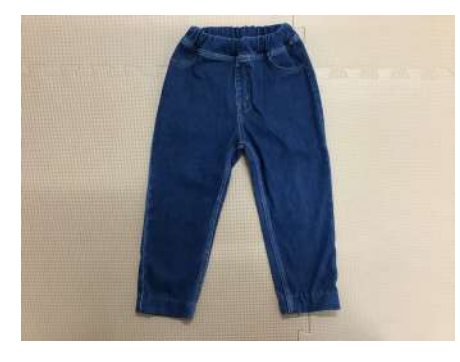
Easy-to-move jeans with outstanding elasticity.