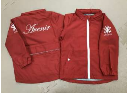
Windbreaker for stroll