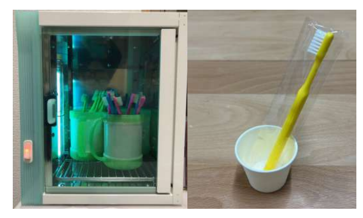
We protect the infants oral health with custom-made baby toothbrushes.

*Even after joining the nursery things such as washing the clothes and disinfectant will all be done at the nursery.