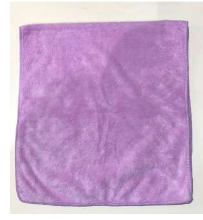
We use a fluffy and highly absorbent microfiber material for bathing towels.