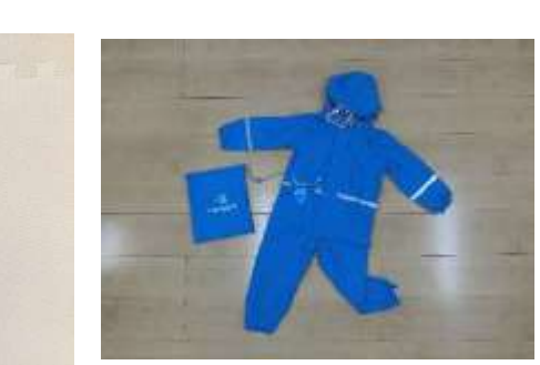
Shorts and shoes for Raincoat (for 2-years-old)