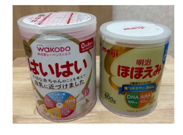
You can specify the powdered milk that your child is accustomed to drinking at home.