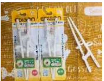
From 1 year old Teaching the children to use chopsticks as they grow up.